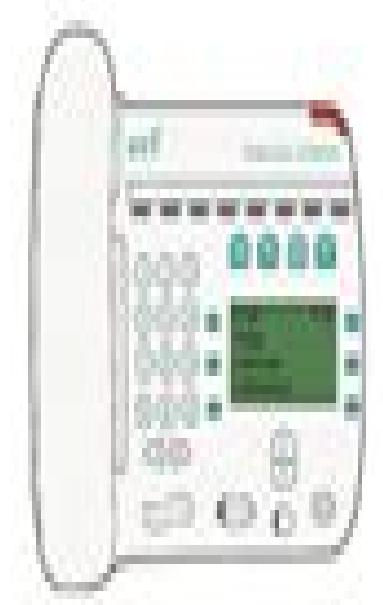
FeatureLine & Softbank (Only Softbank Line)

General installation The device should be installed in a dry, well-ventilated area.