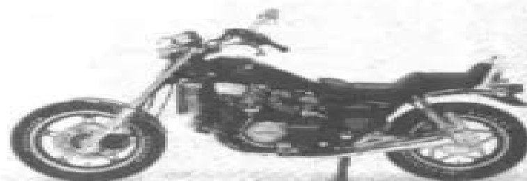
V45 MAGNA BEGINNING F NO. RC071 - CM000001 E NO. RC07E - 4000001