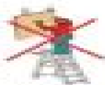
Illustration of a worker on a scaffold with a red X over it, indicating a warning or prohibition.