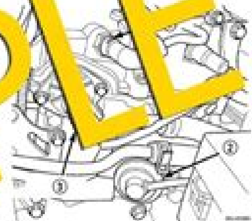
Fig. 1. Cambridge Position Service.