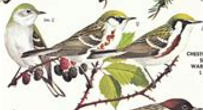
CHESTNUT- SIDED WARBLER 1.475"