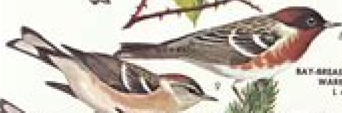
BAY-BREASTED WARBLER 1.475"