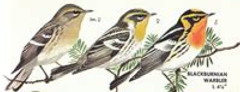
BLACKBURNIAN WARBLER 1.475"

Abundant in coniferous forests. Spring male has distinct black crown, white cheeks, and white throat, which distinguish it from the Black-and-white (p. 252) and Black-throated Gray (p. 264). Struck-back, buffy yellow feet and legs, white undertail coverts, and prominent white wingbars on the olive wings are good field marks of the female and all fall birds. This is an abundant migrant in the Atlantic states, often seen on low branches. Song is high, thin, and distinctive; either fast or slow, but of separate notes in a monotone, often loud in the middle, soft at both ends, 4-7/min.