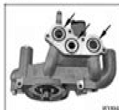
Figure 491 Oil filter base assembly O-rings

⚠ CAUTION: To prevent personal injury or death, contain and dispose of engine fluids in a proper container according to applicable regulations.