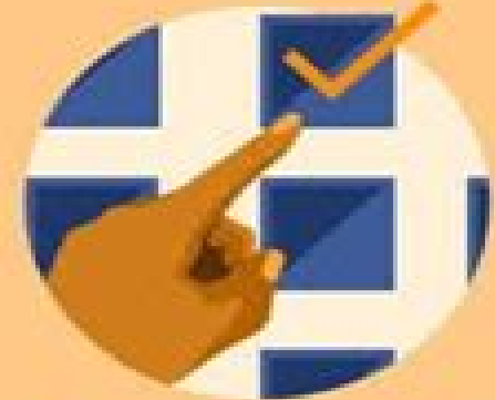
3. Gut instincts