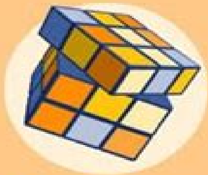
1. Trial and error