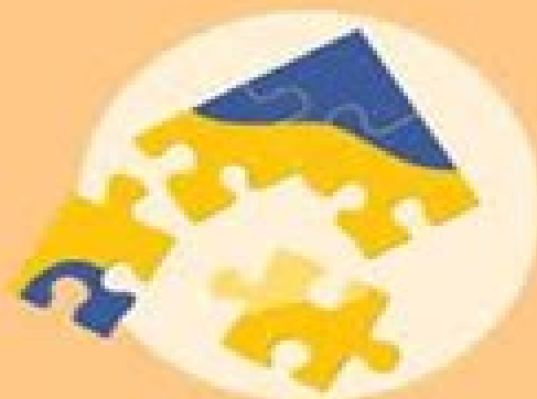
4. Working backwards