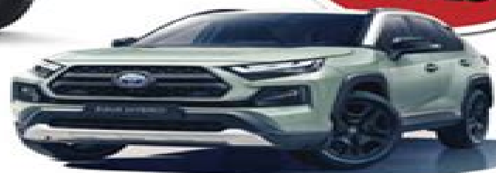
TOYOTA RAV4 HYBRID

TESTED & RATED 135 NEW SUVS, 4WDS & UTES