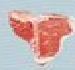
T-Bone Steak GRILL / PAN FRY