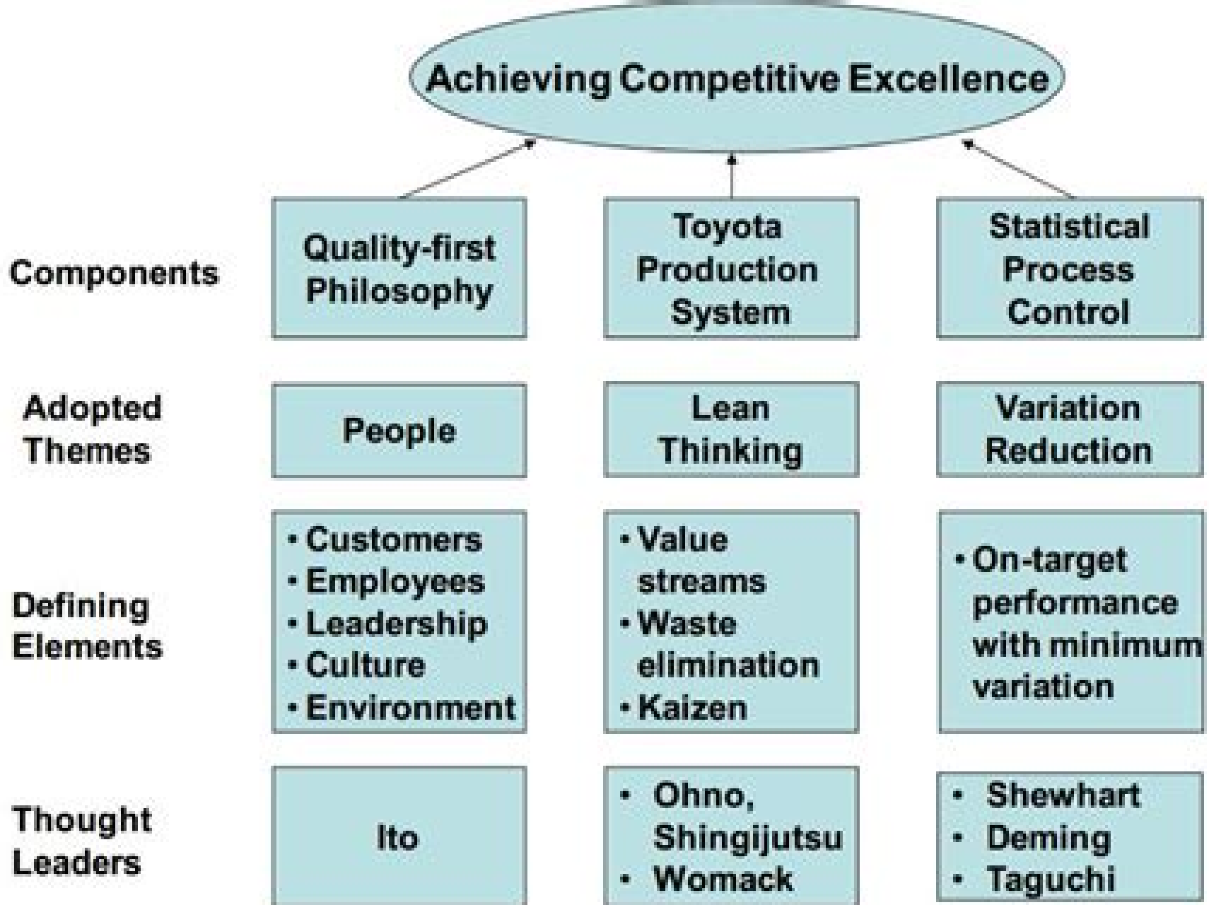
Figure 6 Contributing Components to ACE Program 35