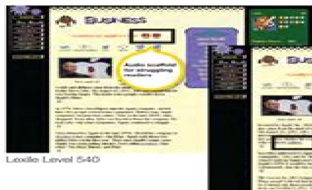
Lexile Level 540

give teachers the means to reach every student at his or her individual level . By delivering the same assignment to each student at his or her specific Lexile/reading level , Achieve allows everyone to be a successful, active participant in classroom discussions and debates.