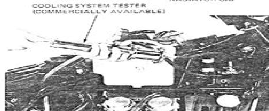
COOLING SYSTEM TESTER (COMMERCIALLY AVAILABLE)

Repair or replace components if the system will not hold the specified pressure for at least six seconds.