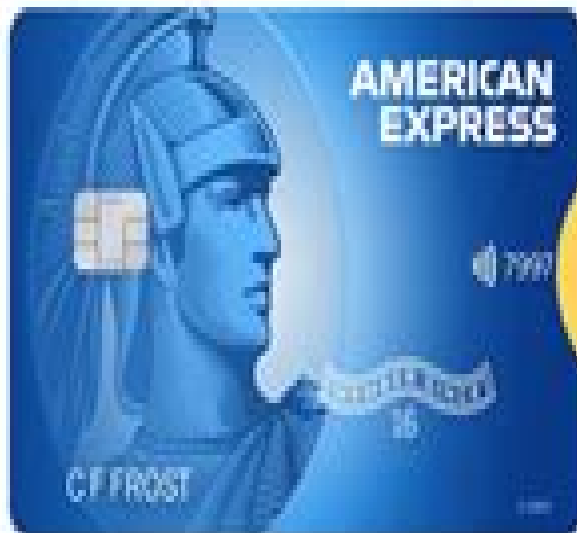
American Express Blue Cash Everyday Card Cash Back