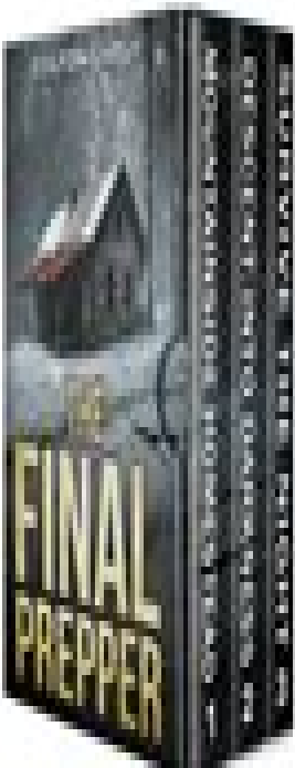
The Final Prepper