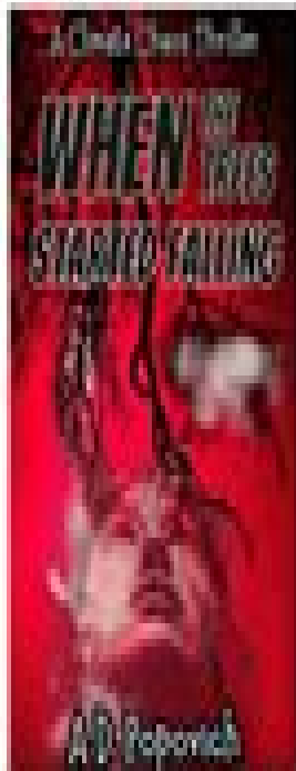
When the Trees Started Falling: A Climate Chaos Thriller