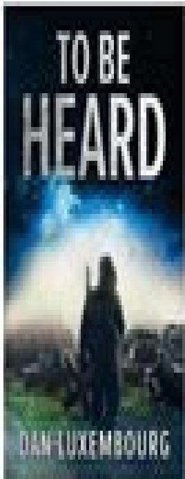
To Be Heard: A Post - Apocalyptic Novel