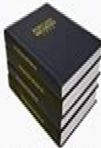
HARD COVER BINDING