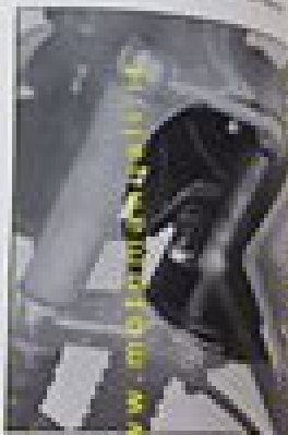
Fig. 2. Vista in sezione del motore del motore agli idrocarburi di tipo 100.000.000.