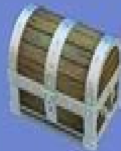
Scrooge McDuck's Locked Chest