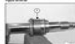
Remove the top cover of the hydraulic pump. Page 20-20-1