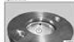
Remove the top cover of the hydraulic pump. Page 20-20-1