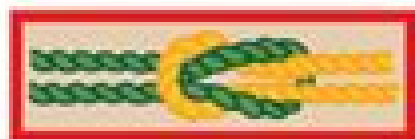
James E. West Fellowship Award