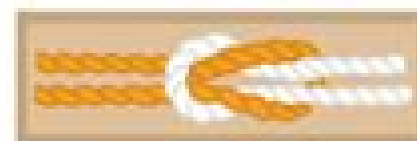
Silver Antelope Award