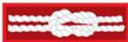
Order of the Arrow Distinguished Service Award