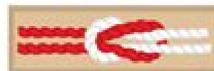
Silver Buffalo Award