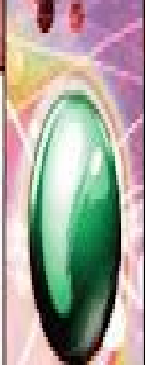
SOUL OF TIME STONE