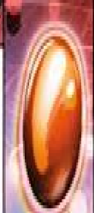
SOUL OF TIME STONE