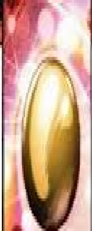
SCRYER MIND STONE