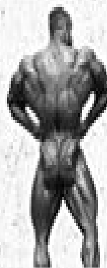
REAR LAT SPREAD