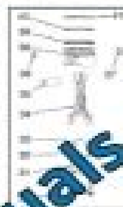
Fig. 3. Identifying Engine Block Assembly Components...1.4L, 1.6L and 1.8L