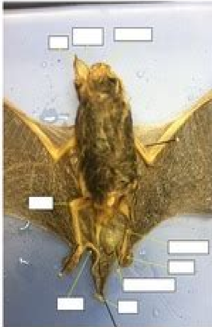
Figure 1a – Exterior of bat