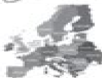
Bonn, Beethoven's hometown, is located in the western part of Germany. During the time of Napoleon, Bonn came under French control and later part of the Kingdom of Prussia. In 1871 it became part of unified Germany.

Ludwig's mother was kind and patient, but his father was difficult to get along with. He had a bad temper and was often drunk. When it became obvious that young Ludwig had musical talent, his father pushed him hard to excel. In Johann's view Ludwig was a child prodigy who could help support the family. Ludwig did not have an easy childhood, but he did have his music, which he loved.