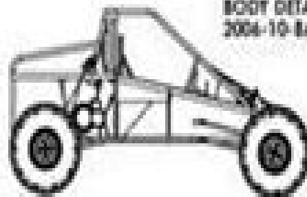
BODY DETAILS 2006-10-BAL-001-01 TO 04