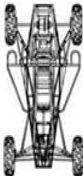
PEDAL BOX DETAILS 2006-10-BAL-001-08