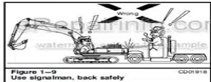
Figure 1-9 Use signalman, back safety