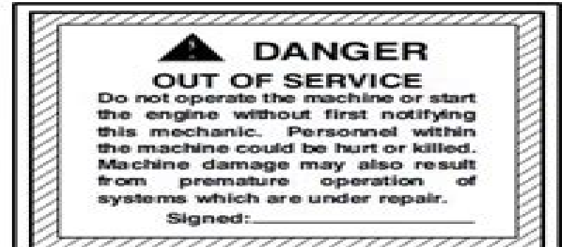
Figure 1-8 Remove the keys from the ignition and post a sign to make others aware of repair activity.