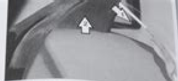
Fig. 4. Pry slowly from in direction of arrow 3, then lift out of arrow 2