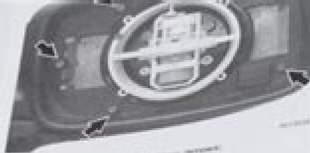
Fig. 2. Mirror housing mounting screws (arrows)