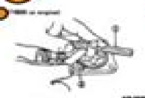
Fig. 2-148 Measuring valve-to-guide and guide-to-cam clearance