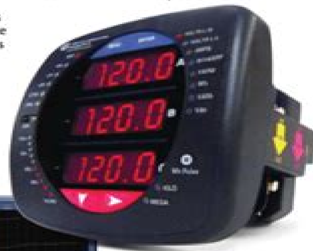
Avtron ADMS Digital Meter, Real-Time Data Logging and Trending Screens.