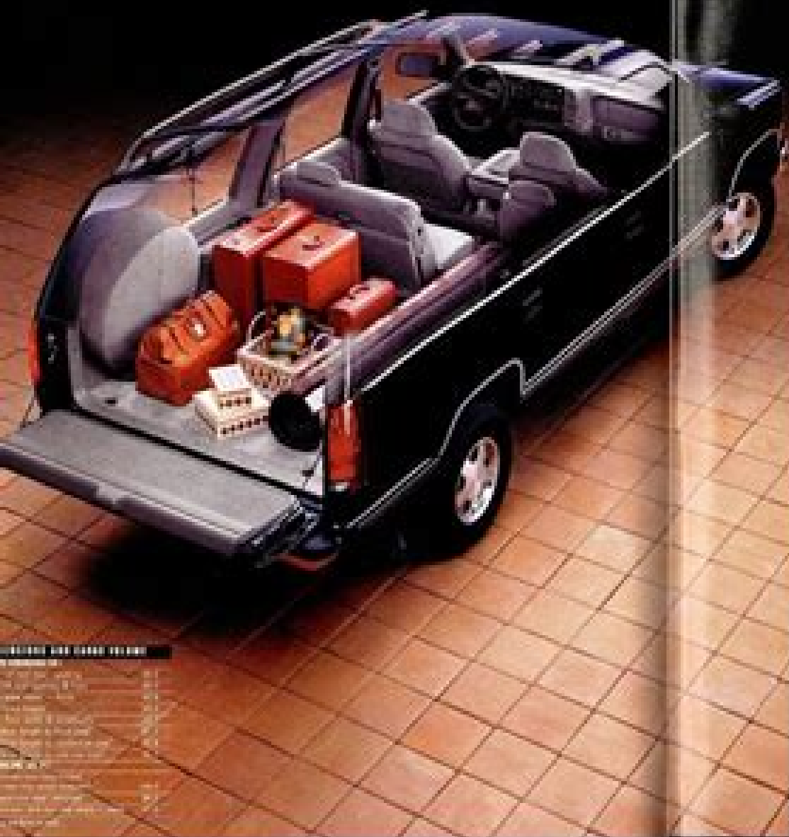
1992 Subaru 3-Door 4-Door Hatch with interior and folded seat for use as second seat.

By utilizing its innovative Suburban-style second-row seat, the 3-door hatchback offers maximum storage space by a variety of available seating arrangements designed for total control. The convenience for all passengers is assured. Full interior storage and well-secured for storage and to create space for up to 100 cubic feet of cargo. The rear window is easily lowered by one inch down to the ground without the need for any tools or equipment. The rear window is easily lowered by one inch down to the ground without the need for any tools or equipment. The rear window is easily lowered by one inch down to the ground without the need for any tools or equipment.