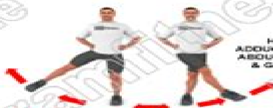
HIP ADDUCTORS, ABDUCTORS & GROIN