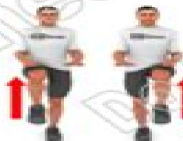
LOWER BACK, HIPS & HAMSTRINGS