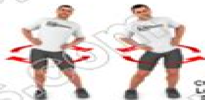
CORE & LOWER BACK