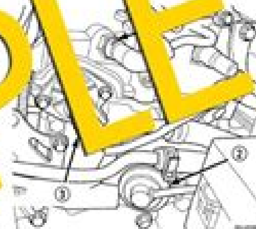
Fig. 1 Camshaft Position Sensor - 2.0L 4L, DOHC

The PCM sends approximately 5 volts to the Hall-effect sensor. This voltage is required to operate the Hall-effect chip and the electronics inside the sensor.